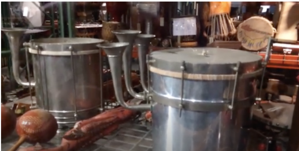
Brazilian cuicas at the Rhythm Discovery Center, Indianapolis