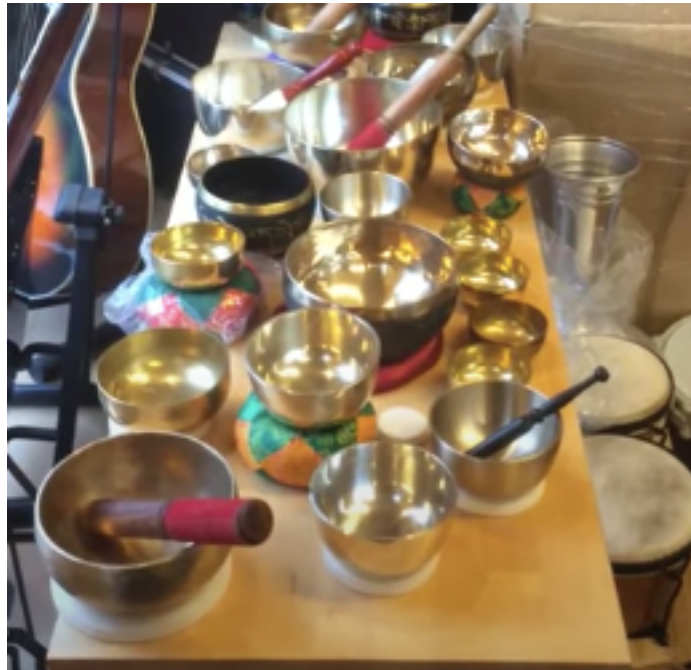
Singing bowls in Sangitamiya Music Store, Reykjavik

We would welcome video material sent in by members to put on the channel.